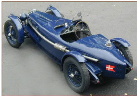
My Merlin Nine based project from 1980